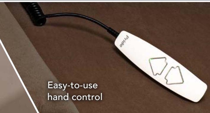
Easy-to-use hand control

ENERGY EFFICIENT WITH BUILT-IN BATTERY BACKUP