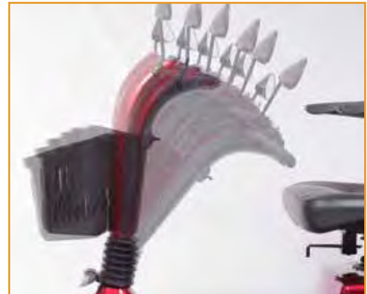
Patented infinite adjustable tiller