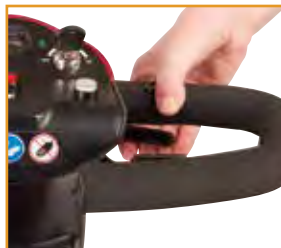
EZ Reach tiller adjustment