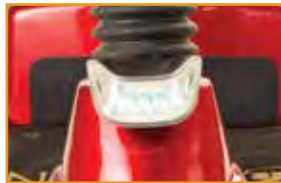
Angle adjustable LED headlight creates a wide path of bright light