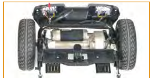
Quiet & maintenance free motor